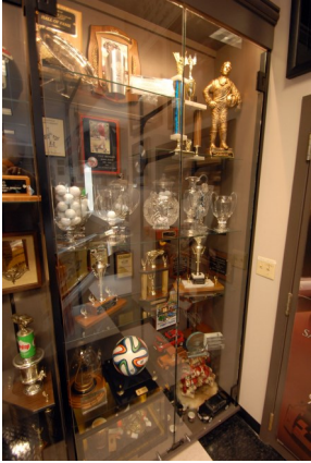
EMPA HOF trophy on top right shelf.