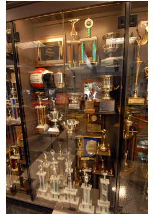
EMPA Driver of the Year Award on top left shelf.