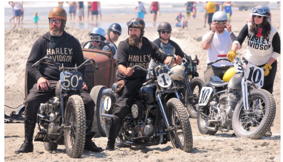
The Race of Gentlemen 2017—Wildwood, NJ