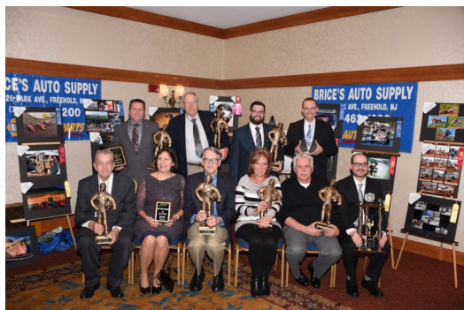
Hardware going home with Hall of Fame inductees and EMPA award members

Port Royal Speedway receiving the Jerry Reigle Outstanding Contribution to Sprint Car Racing Award