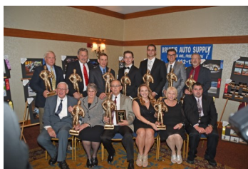
All of the winners (L) EMPA member winners (R)