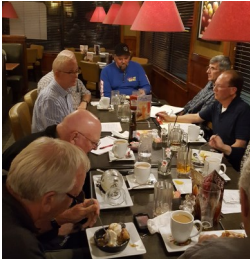
EMPA Board and committee chairs busy at work (L)...or maybe just enjoying dessert (R).

All renewals are now due and can be done now or when you return your ballot sheets. If you have a friend or colleague considering joining but not quite ready to take the leap, please consider bringing them to the convention as a guest. The price is right and while they can't enter the contests, they can meet everyone and get a feel for what they're missing.