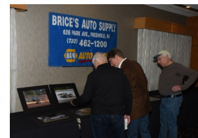
Photo contest judging is underway